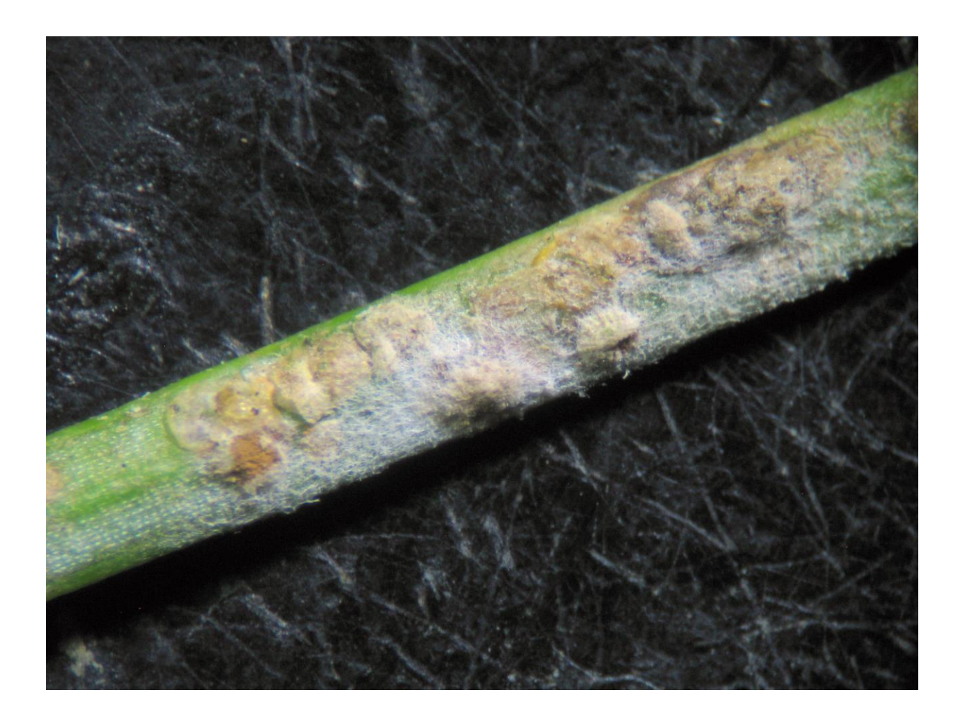
Fig. 1. Several insect pathogenic fungi can infect and kill armored scale pests that feed on Christmas trees. These cryptomeria scales on Fraser firs probably were killed by the fungus that has produced chamois-like growth over the scales.